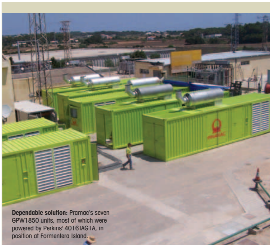
Dependable solution: Pramac's seven GPW1850 units, most of which were powered by Perkins' 4016TAG1A, in position at Formentera Island.