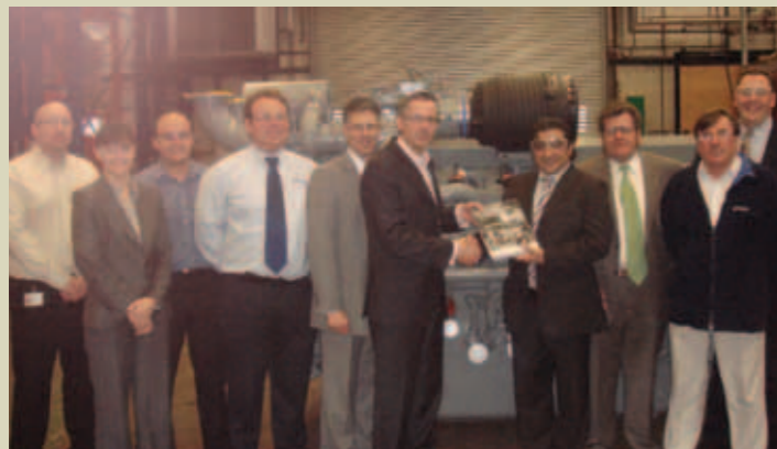
Proud moment: The presentation of the 4016-61TRS2 to Mikano International Limited took place at Perkins' Stafford facility.

Production of the first 4016-61TRS2 engine at Perkins' Stafford plant was celebrated with a special presentation to Mikano International Limited.