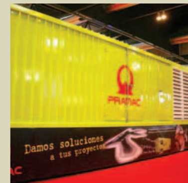
Generating interest: The GPW1850 attracted much attention at Matelec.