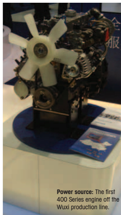
Power source: The first 400 Series engine off the Wuxi production line.