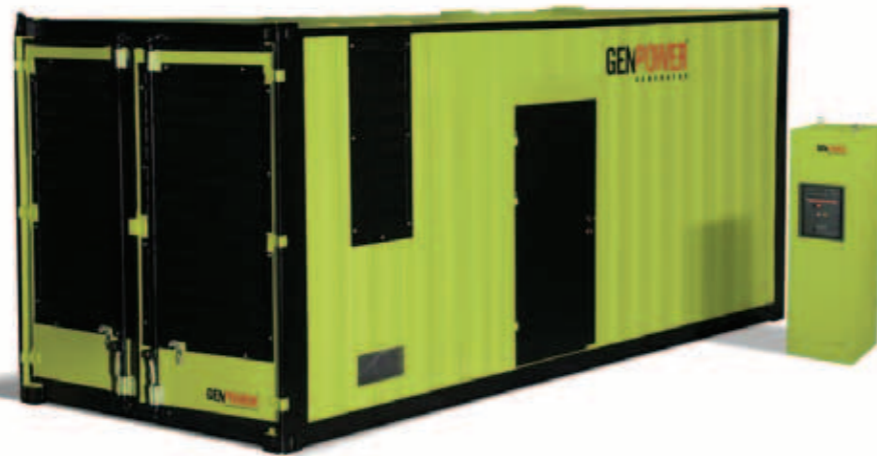
Pictures this page: Genpower has seen significant growth since the business was established in 2000.

The company also provides standard generators ranging from 2.2kVA to 2264kVA.