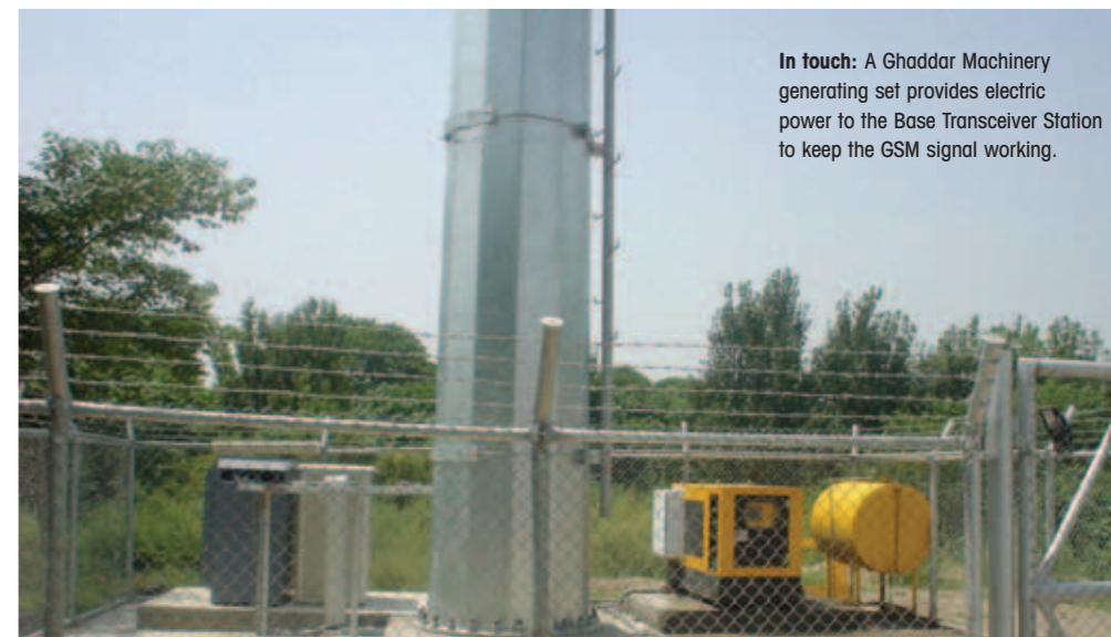
In touch: A Ghaddar Machinery generating set provides electric power to the Base Transceiver Station to keep the GSM signal working.

Ghaddar Machinery altered the design of the control panel to contend with extreme conditions and ambient temperatures. The generating set controller adopted additional