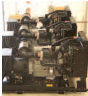
Above right: Himoinsa's HPW400T5 generating set, powered by Perkins' 2306C-E14TAG3, powers the large compactor as it strengthens the ground in Palm Deira.

The Himoinsa soundproof generating sets have proved to be very reliable; with the unit's controller and bodywork design making it suitable for continuous service work in such harsh conditions.