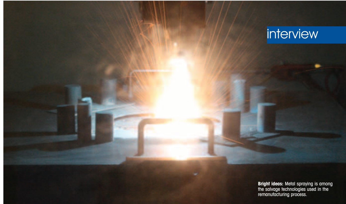
Bright ideas: Metal spraying is among the salvage technologies used in the remanufacturing process.