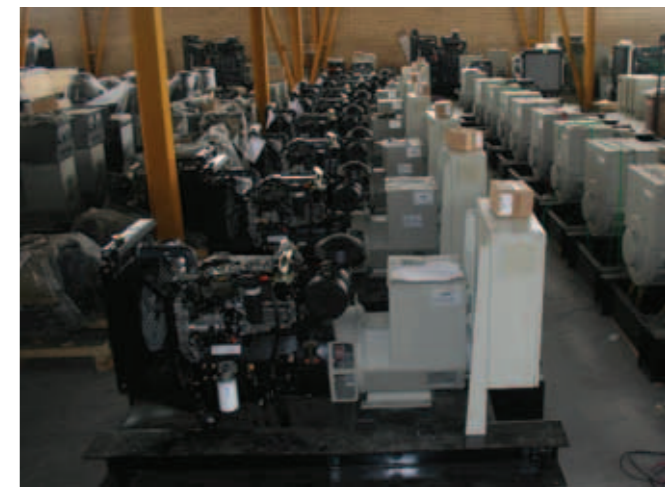
Top: Paivar Diesel Asia has seen strong demand for its products. Above: Sazand has carved a niche position in the electric power market.