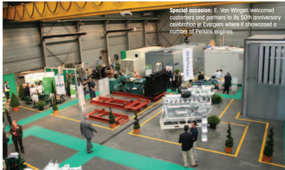
Special occasion: E. Van Wingen welcomed customers and partners to its 50th anniversary celebration in Evergem where it showcased a number of Perkins engines.

Although EVW had been working with Perkins for many years, in 2002 it became Perkins' OEM partner for diesel and gas engines – the first such agreement to be signed.